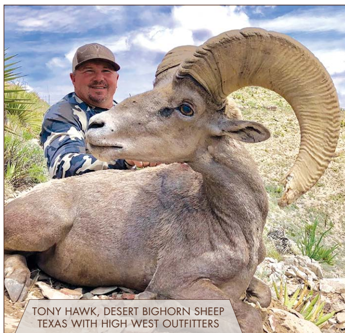
TONY HAWK, DESERT BIGHORN SHEEP TEXAS WITH HIGH WEST OUTFITTERS